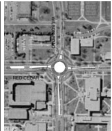
Modern Roundabout Design for the Red Cedar Road – Wilson Road Intersection – East Lansing, Michigan