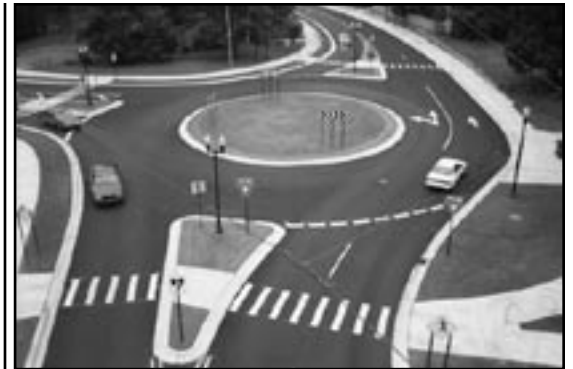
Modern Roundabout at the Marsh Road – Hamilton Road Intersection in Okemos, Michigan

This is without a doubt the most common fallacy encountered, and it strongly influences people's opinions about roundabouts. At some point in their lives, most people have had bad experiences with large, old style traffic circles (also known as "rotaries") such as DuPont Circle in Washington D.C. With their relatively large diameters, high circulating speeds, and merging/weaving requirements, traffic circles often exhibit poor traffic operations and high crash rates (not to mention that driving through them can be unnerving to uninitiated drivers). Those unfamiliar with modern roundabouts often assume that they will cause similar problems since they are also a circular intersection. Although both traffic circles and modern roundabouts utilize round circulating roadways, there are major differences in the design and operation of these two types of intersections. The main distinguishing factors are: