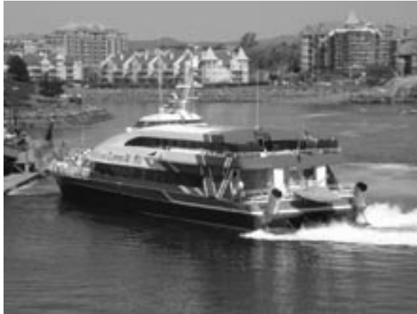
The Victoria Clipper IV in Puget Sound

Nowhere is this more evident than in the Puget Sound area of Washington state, home of one of the largest ferry fleets in the world. Puget Sound is a place where a few residents can still tell stories of the famous Mosquito Fleet that sailed the waters of Puget Sound, carrying passengers and cargo to communities that would otherwise be isolated. Many of these communities grew and flourished around, and because of, the Mosquito Fleet and associated terminals. And yet, today, a true waterborne transit system is non-existent, and the Mosquito Fleet is a distant memory to most.