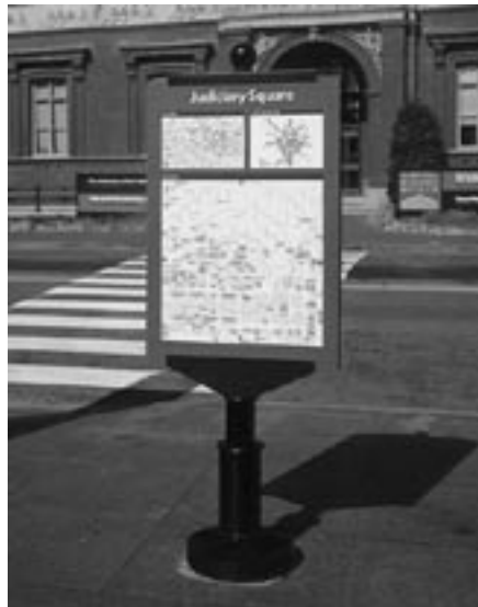
Orientation maps contain overview, neighborhood, and subway maps. Pedestrian directional signs stand out in the streetscape.

The actual construction of the signs and wayfinding components involved work with